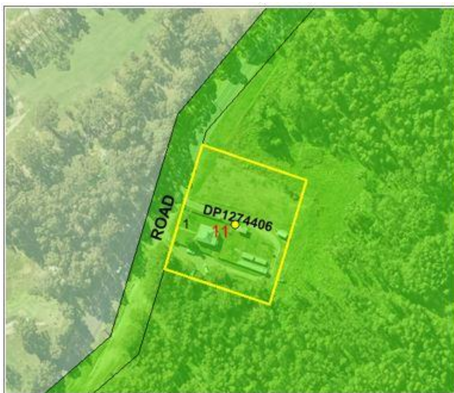
Figure 1 Subject site

The land subject to the planning proposal is 11 Metford Road East Maitland, Lot 1 DP 1274406 with an area of 5,723m 2 . Land uses include Council-owned administration building, animal holding facilities and associated infrastructure.